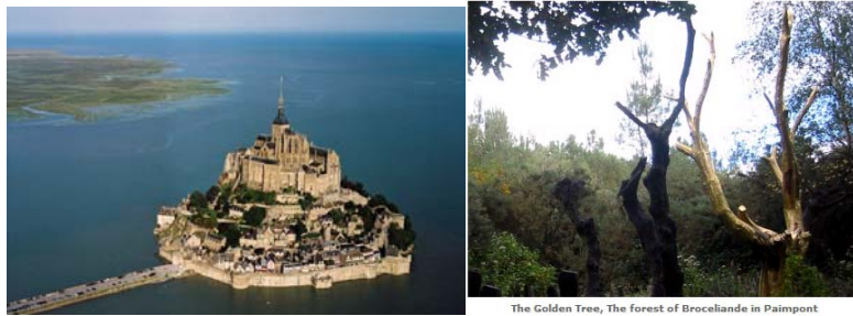
The Golden Tree, The forest of Broceliande in Paimpont

Visit Mont-St- Michel and King Arthur's Forest Also visit Chateau de Comper en Broceliande